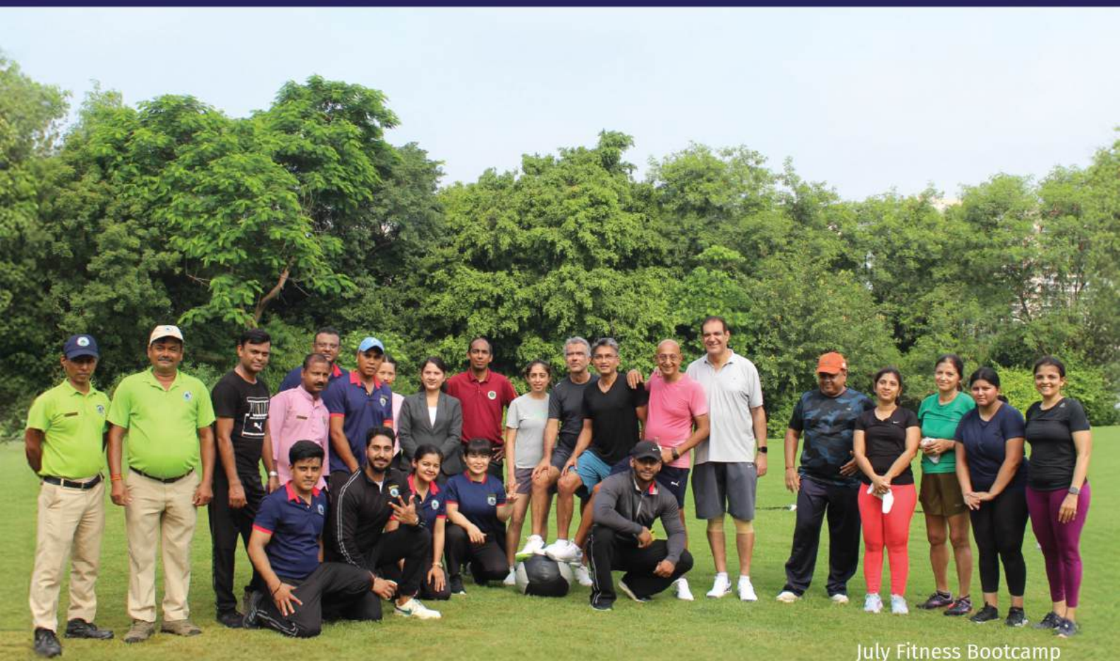
July Fitness Bootcamp