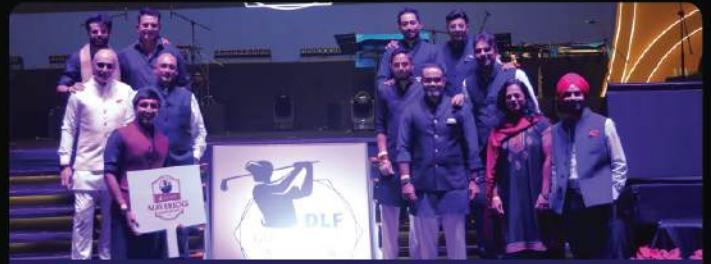
Axis Bank Mavericks